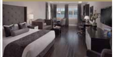
Distinct Style and Plush Amenities