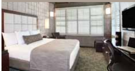
Enhanced Comfort and Service