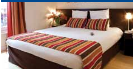
Restful Stay and Value